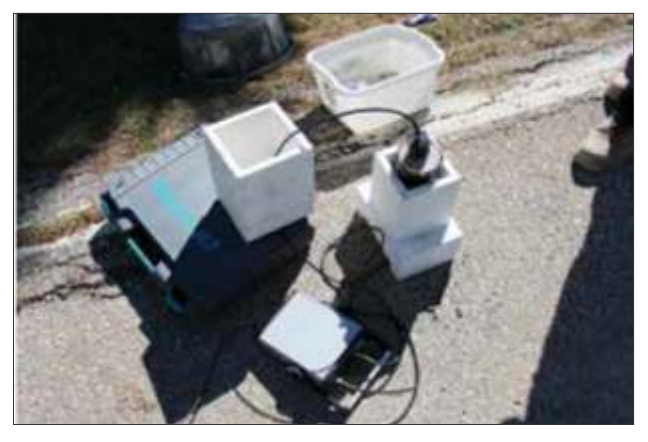
Fig. 2 UPV test set up for a sample in wooden frame<sup>1</sup>

A pilot project was conducted in the USA from 2013 to 2015 when commercial UPV devices were used to track pulse velocities of field samples on more than 24 pavement construction sites¹. At each site, a100 x 200mm test cylinder was filled with sample of concrete taken from a slipform paver. Standard sample preparation procedures were followed. The specimen was then placed in a wooden frame adjacent to the pavement slab, Fig 2¹. This was essential to ensure that the specimen and the freshly constructed pavement slab are subjected to the same external environmental conditions. Initial setting times were recorded when there was marked increase in the velocity of ultrasonic waves.