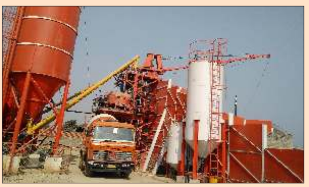
View of Ranchi Plant

With the addition of Ranchi, RMC Readymix (India) now has 82 operational plants across 40 cities in India.