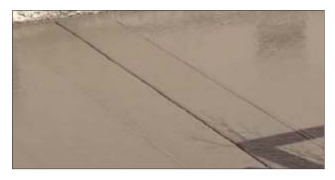
Fig. 1 Typical close-up of a joint

environmental conditions affect the joint cutting time, which needs to be varied depending up on the variations in temperature, humidity, wind speed, changes in mix proportions, etc. Thus, the crucial issue is to determine the appropriate time of cutting joints, taking cognizance of a number of variable factors mentioned above.