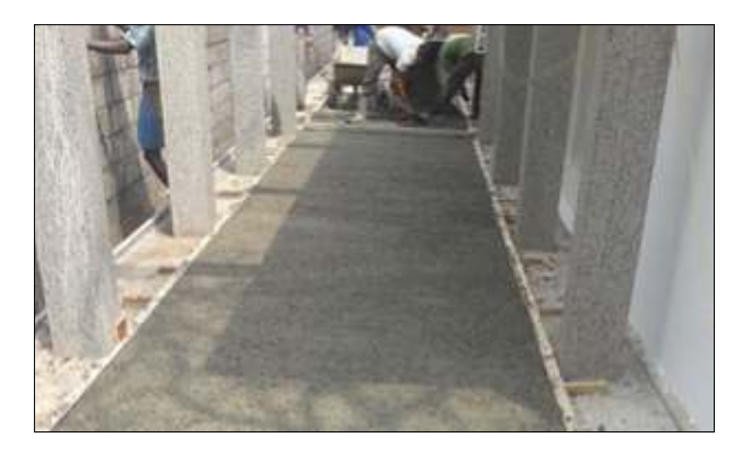
Fig. 4 Laying of Perviouscrete ™

Recently, an old-age home in Coimbatore used this product for its pathway. On the advice of the architect, the client directed their contractor to adopt this special product in the construction of pathways, Fig. 4. The architect specially instructed to use lower size aggregate, i.e. 10mm down and have proper finish, so that people can walk on the pathway comfortably.